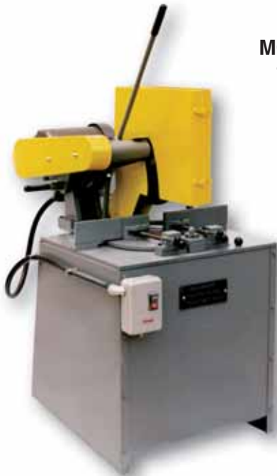
MODEL KM16-18 16 – 18" SAW

MODEL KM10 3 HP, 1 PH (110/220V) or 3 PH (220/440V); please specify voltage. Mitres either direction 45°. 5/8" wheel arbor. Positive index holes and up/down stops. Two cam lock vises, lever lock for table. Wt. 220 lbs.