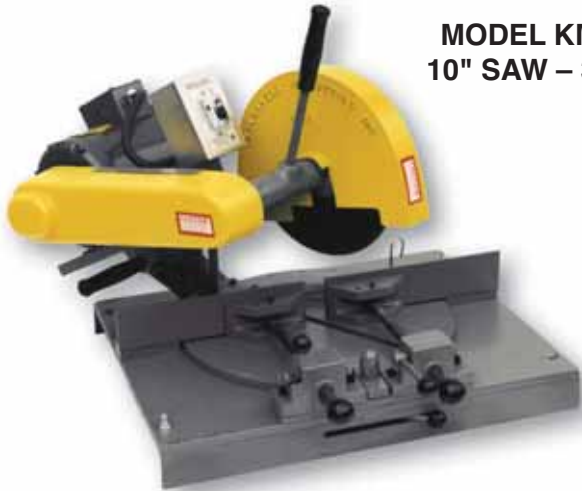
MODEL KM10 10" SAW – 3 HP