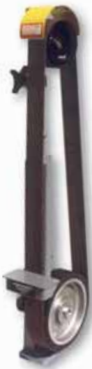
2FS72/2FS72M MULTI-POSITION BELT GRINDER