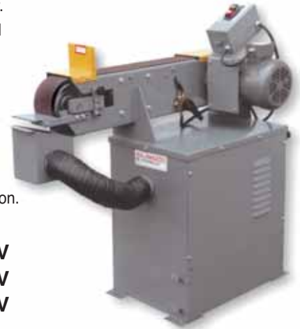
MODEL KS390HV MODEL KS490HV MODEL KS690HV

MODEL KS390 2 HP, 1 PH or 3 HP, 3 PH; please specify phase and voltage. Magnetic switch. Wt. 380 lbs.