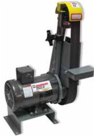
MODEL BG248 MULTIPOSITION BELT GRINDER

MODEL BG142 1/2HP 1PH TEFC motor (110V or 220V), 5400 SFPM. 6" x 2", serrated 70 duro contact wheel, 1" x 42" belt, multiposition, removable work platen and work table. Wt. 50 lbs.