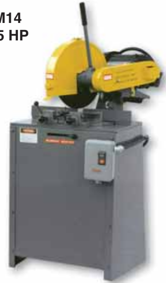
MODEL KM14 14" SAW – 5 HP

MODEL KM16-18 10 HP saw duty, 3 PH motor; please specify voltage 220/440. Uses 16" or 18" abrasive wheel (not included). 1" wheel arbor. Mitres either direction 45°. Two cam vises. Low voltage manual starter. Dry model only (not available wet). Wt. 750 lbs.