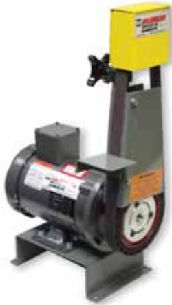
MODEL BG142 MULTIPOSITION BELT GRINDER