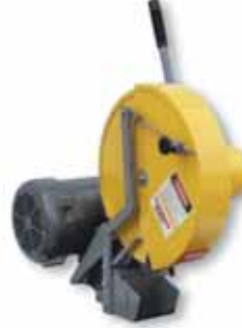
HS14AS 12" - 14" blade

HS14AS 12-14" blade, Non-ferrous arm assy., 5 HP, 1 PH (220 volt 60hz), 3 PH (220/440 60 hz), OSHA guard for carbide blades, 1" arbor, Spindle RPM 4400, 4 bolt mount, Manual switch, Please specify voltage, Weight: 225 lbs.