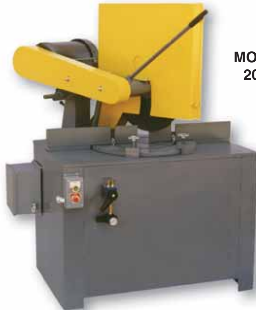
MODEL KM20-22 20 – 22" SAW

MODEL KM14 5 HP, 1 PH (220V only) or 3 PH (220/440V); please specify voltage. Mitres either direction 45°. 1" wheel arbor. Positive index holes and up/down stops. Two cam lock vises, lever lock for table. Wt. 400 lbs.