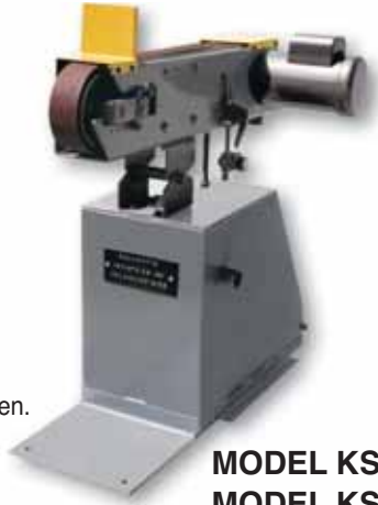
MODEL KS390 MODEL KS490 MODEL KS690